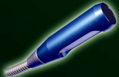
other colours available on request