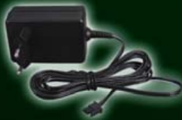
12 V plug-in power supply for XLR Plug 543-102