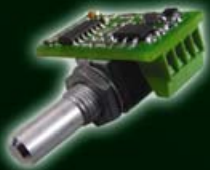
Dimmer LC-PWM 324 (OEM-Version) 547-002