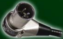
With right-angle plug 551-021 and 022