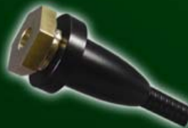
Brass screws and mounting kit fitted