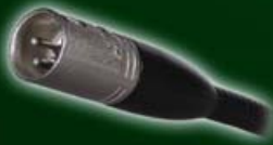
With standard XLR plug 551-001 to 004