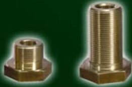
Brass screws 548-131 and 548-132