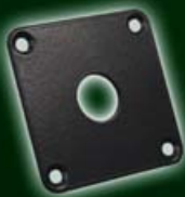
Adapter plate 3 for permanent mounting 548-113