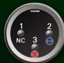
other layouts available on request