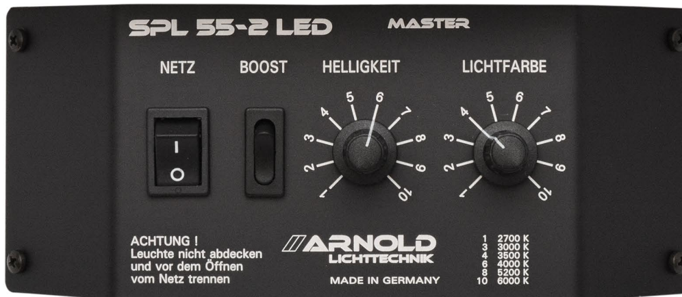
Control- Panel of the Master- Luminaire